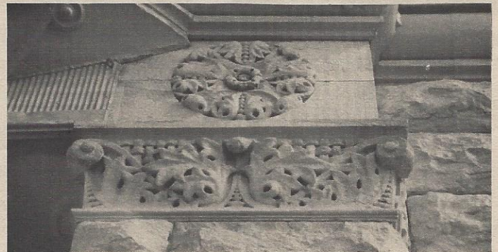
Capital and Rosette, Newcomb Hotel 4th & Maine, 1888