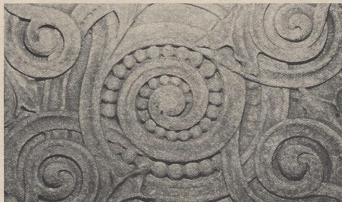
Louis H. Sullivan Ornament: Falkenau House Chicago, IL - 1888

intricate natural forms that went into a Sullivan creation. The inside of this home also features carvings in the woodwork that resemble the style.