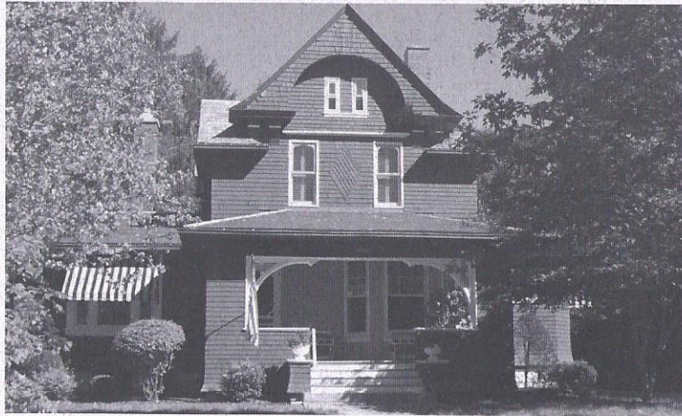
1843 Grove Queen Anne/Shingle Style • 1898 • Ernest Wood House