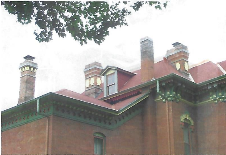
17. Small dormer on west façade including molding. 18. Five brick chimneys, three with multiple brick moldings and thick cross pattern, one with multiple brick molding and modillions, and one square stack with one band of molding.