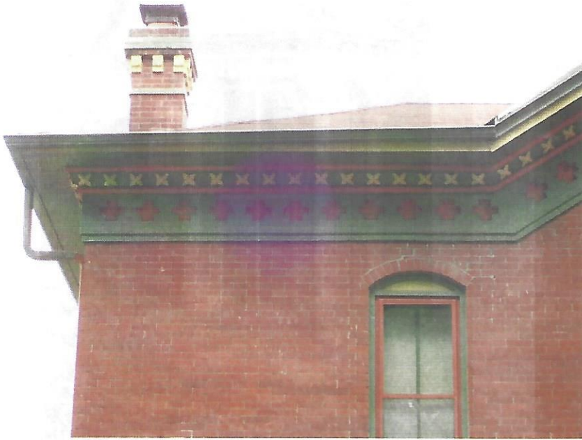
16a. Truncated hip roof. 16b. Ornamented cornice with wood fascia.