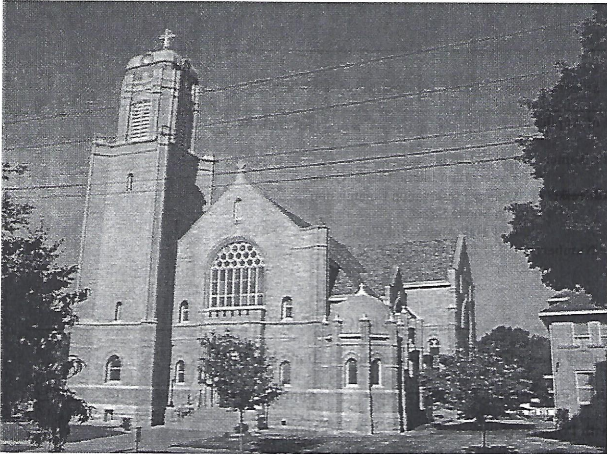
East facade - main gable in center, southeast bell tower, northeast Baptistry, pale yellow brick, rough cut stone foundation with smooth top course, stone belt course