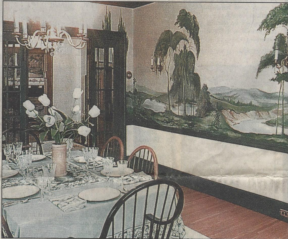
The dining room's hand-painted murals were popular during the Arts and Crafts era. The landscape captures the beauty of nature.

The musical McDevitt family uses the original five-sided sun parlor as a music room. The family turned the second floor sleeping porch into a playroom and the original maid's room — complete with original medicine cabinet and original intercom — is now a bedroom. The suite that the Spricks used for guests is now the master bedroom. Splendid architectural features punc-