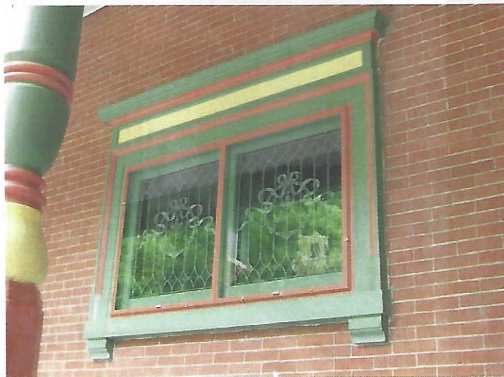
12. Square double leaded glass window on main level on the south façade with wood framing and brackets.