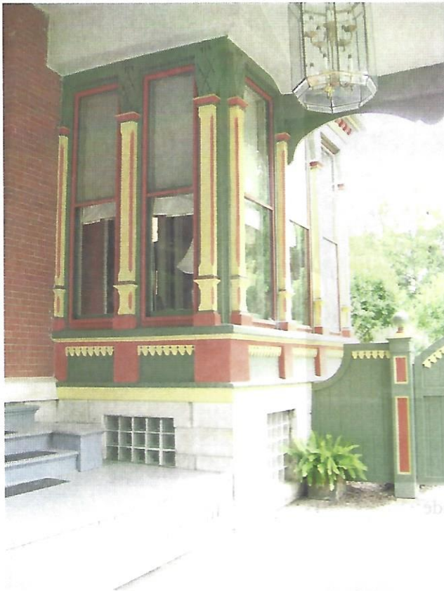
11. Projecting square bay on south side with porch on second level.