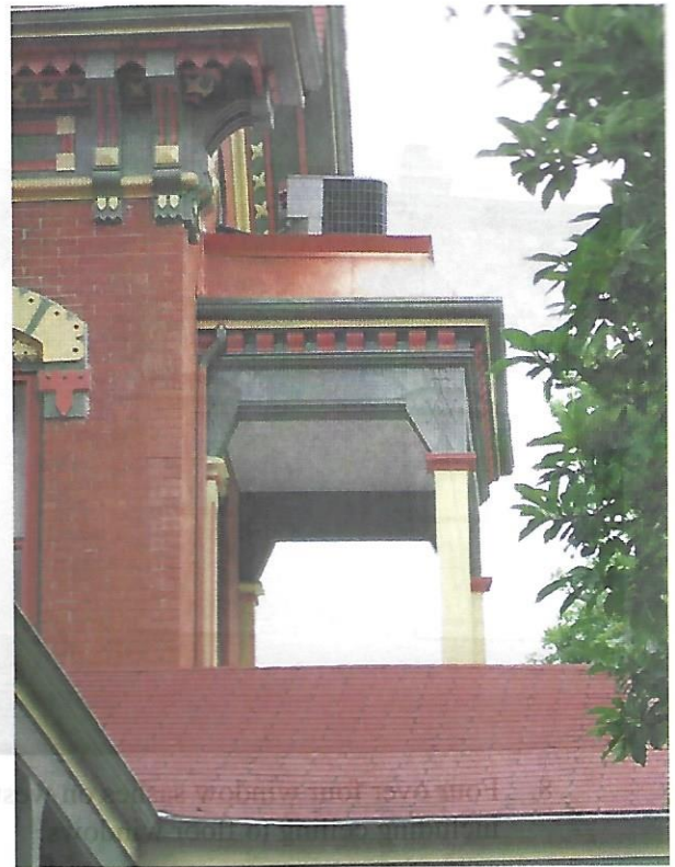
11b. Porch with simple wood posts with wood frieze & hinge with incised Eastlake carvings