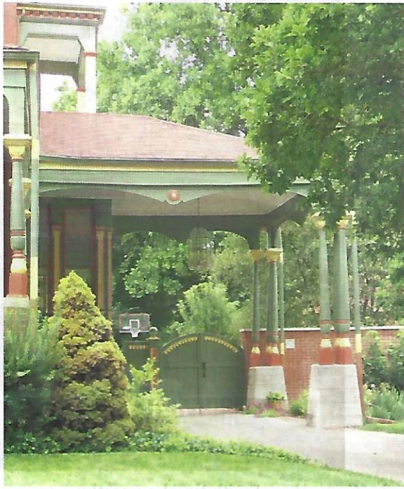
4. Queen Anne porte-cochere 4a. Simple wood cornice with rosette molding. 4b. Vaulted wood paneled ceiling.