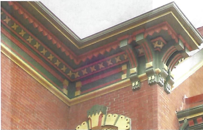
5. Carved wood cornice features bed mold, embellished with repetitive applied cross patterns above a paneled frieze underneath a projecting saw tooth trim along the edge of the eave, as well as large paired carved wood brackets.